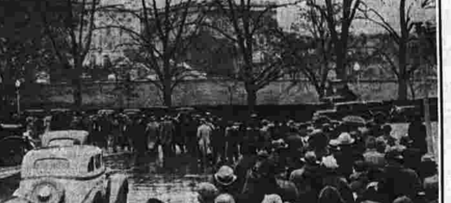
Shouting "We're hungry! We're hungry!" and singing Communist songs, 200 fundless delegates to the meeting of the Workers' Alliance in Washington paraded and picketed the Capitol...

Shouting "We're hungry! We're hungry!" and singing Communist songs, 200 fundless delegates to the meeting of the Workers' Alliance in Washington paraded and picketed the Capitol with demands that Congress provide funds for transportation to their homes.